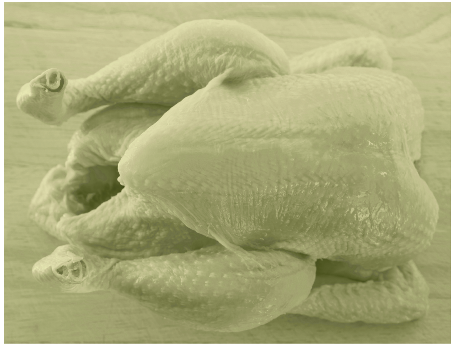
Policy and Practice Notes

A Rural Economy and Land Use Programme research project investigating the extent to which stakeholder participation can improve the management and communication of risks associated with the food chain.